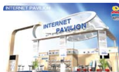
◀ The Internet Pavilion booth at ITU Telecom World

www.nro.org/governance/itu-exhibition-info.html