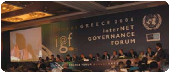
▲ Large panels at the IGF allowed broad representation but did not always create the most focused discussions.

of this nature, as it represents the combined experience of the five RIR communities, all of which are based on community participation and open structures. The RIR model of bottom-up policy development and consensus building is frequently held up as one of the most successful aspects of existing Internet governance structures.