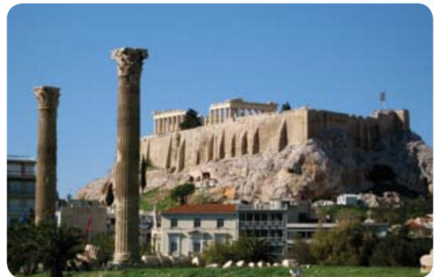
▲ Athens, venue for the first IGF, inspired many speakers to draw parallels between the development of democracy and issues of Internet governance.

On this measure, the inaugural IGF can be considered a success. While the conduct of most of the sessions would have been quite familiar to people accustomed to meetings held in the "Internet