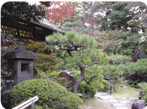
◀ Japanese garden at the Kyoto International Conference Hall.